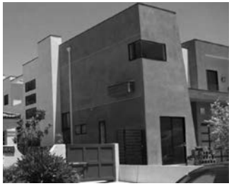
Example of home allowed by former R1 zone. House oversized for lot, impeding on neighbors' light, air, space, privacy. Attached garage doesn't count toward maximum square footage of building.