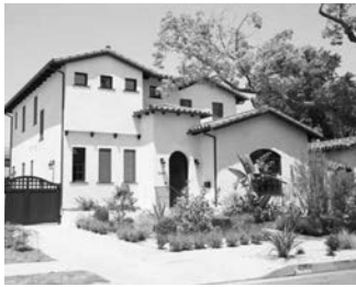
Example of home allowed by new R1R3-RG zone Rear garage creates buffer between homes. Sensible floor area guidelines prevent mansionization while allowing flexibility for additions, remodels, new construction.

Responding to constituents' requests for protection from mansionization and for preservation of neighborhood character, the Planning Dept. proposed—and the City Council approved for Faircrest Heights on March 8 – a new single family zone called R1R3-RG, which sets the maximum floor area ratios based on lot size and calls for new second stories to be located toward the rear of the house and new garages to be at the rear of the property. A few unusually shallow lots were zoned R1V3-RG, which allows the second story to be at any location above the first. These zones respond to our residents' desire to limit the current mansionization while offering flexibility for additions, remodels and new construction.