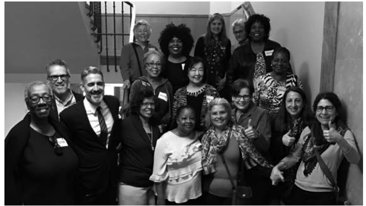
Neighbors at City Hall, celebrating the March 8 City Council vote